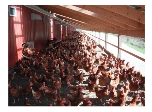
Barn Raised Birds in winter garden....