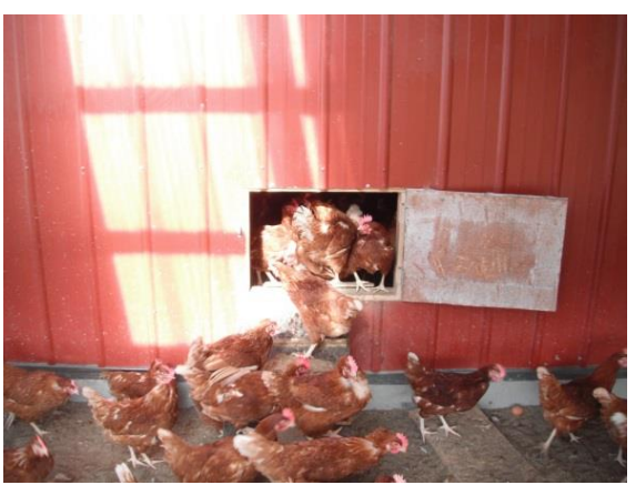
Exit from barn to winter garden