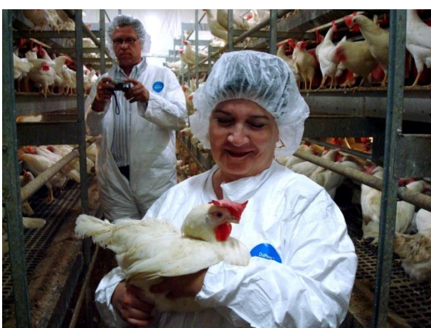
Barn Raised – aviary system