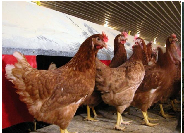
Barn raised birds in front of nest box