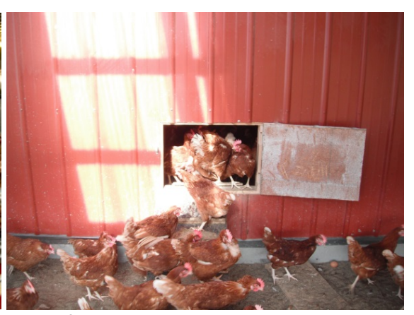
Exit from barn to winter garden