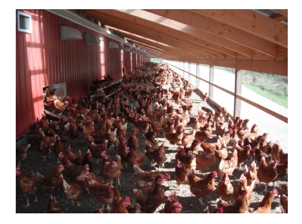
Barn Raised Birds in winter garden....