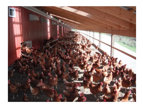
Barn Raised Birds in winter garden....