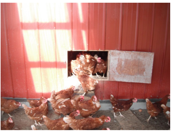
Exit from barn to winter garden