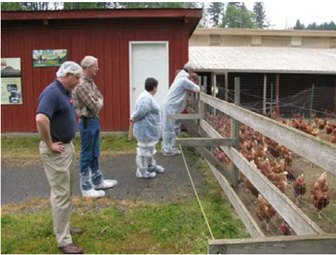
Free Range Chickens: Min. 2 sq. ft/hen – outdoors – weather permitting