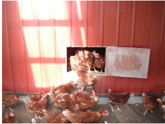
Exit from barn to winter garden