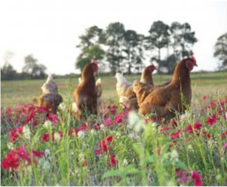
Pasture: 108 sq. ft/bird outdoors all year around -