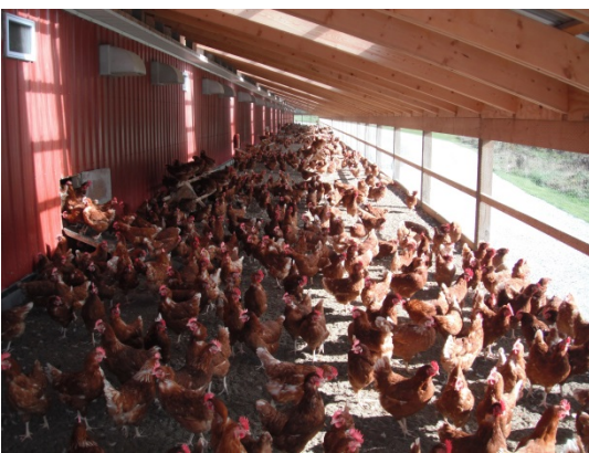
Barn Raised Birds in winter garden....