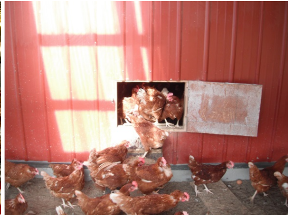
Exit from barn to winter garden