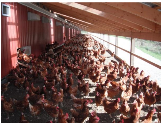
Barn Raised Birds in winter garden....