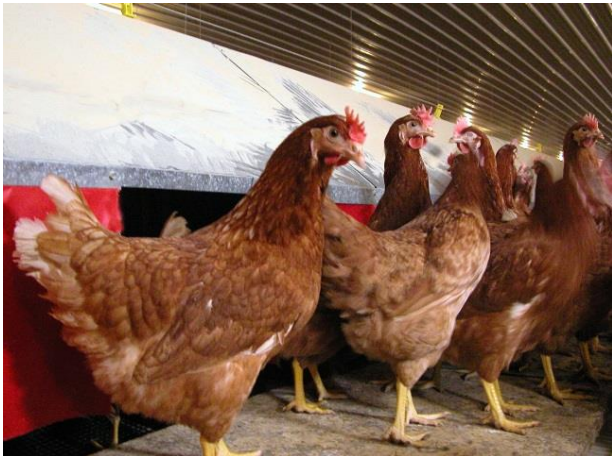
Barn raised birds in front of nest box