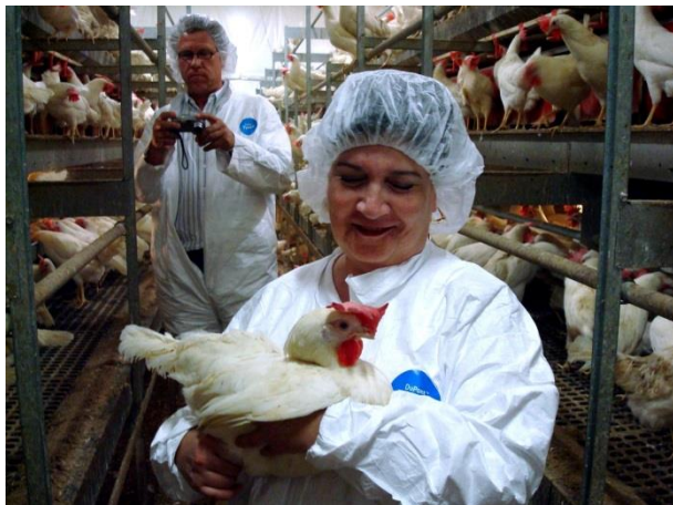
Barn Raised – aviary system