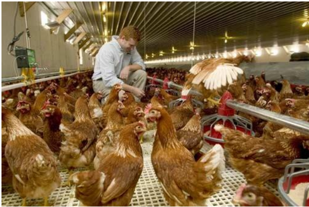
Cage free/barn raised 1.5 sq. ft/bird