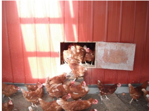
Exit from barn to winter garden