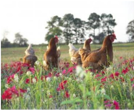
Pasture: 108 sq. ft/bird outdoors all year around -