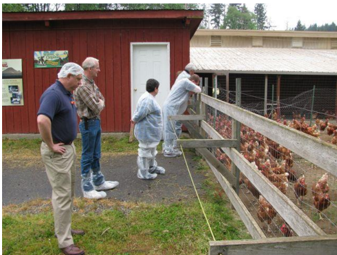
Free Range Chickens: Min. 2 sq. ft/hen – outdoors – weather permitting