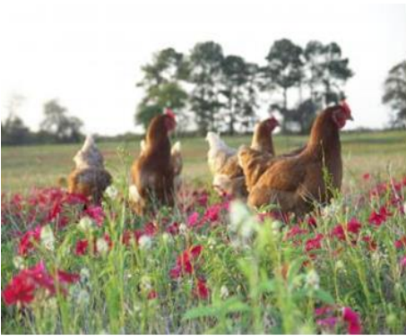
Pasture: 108 sq. ft/bird outdoors all year around -